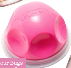
Colour Bugs Makeup for Hair, £14, in Candy Pink