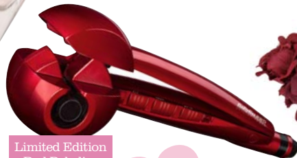
Limited Edition Red Babyliiss Perfect Curl, £149.99