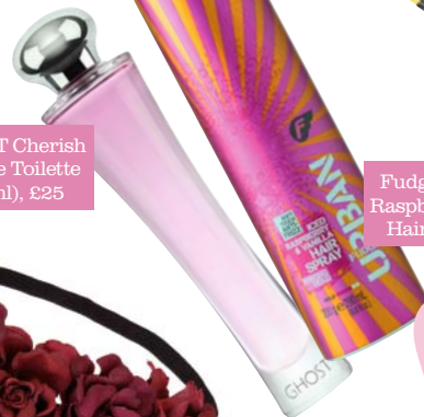
Fudge Urban Iced Raspberry & Vanilla Hairspray, £4.99