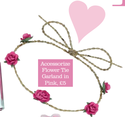
Accessorize Flower Tie Garland in Pink, £5