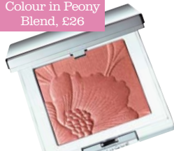
Clinique Fresh Bloom All Over Colour in Peony Blend, £26