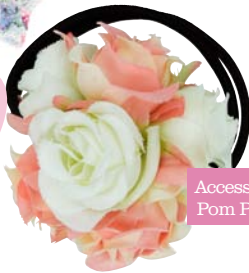
Accessorize Flower Pom Pom Pony, £6