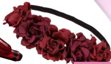
Diva at Miss Selfridge Burgundy Flower Headband, £10