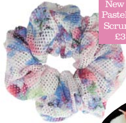
New Look Pastel Print Scrunchie, £3.99