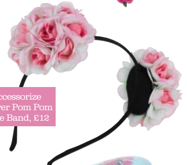
Accessorize Flower Pom Pom Alice Band, £12