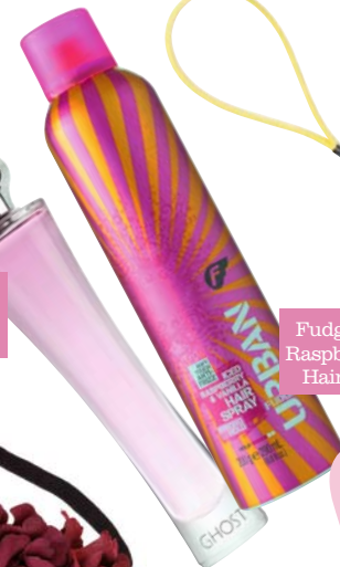
Fudge Urban Iced Raspberry & Vanilla Hairspray, £4.99