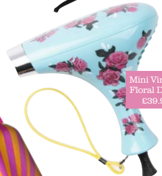
Mini Vintage Floral Dryer, £39.99